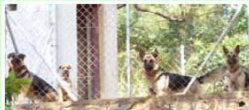
Bright Eyes, Sadie, Rockie and Jessie in the kennel in Blantyre

down with malaria or something like it, and had to miss the last day and half. The study went well.