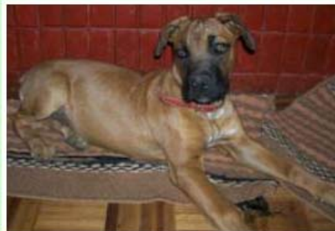
Sadie, Lucy's sister in Blantyre (current)